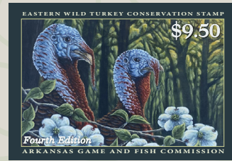
Artist: Eddie Tipton 2023